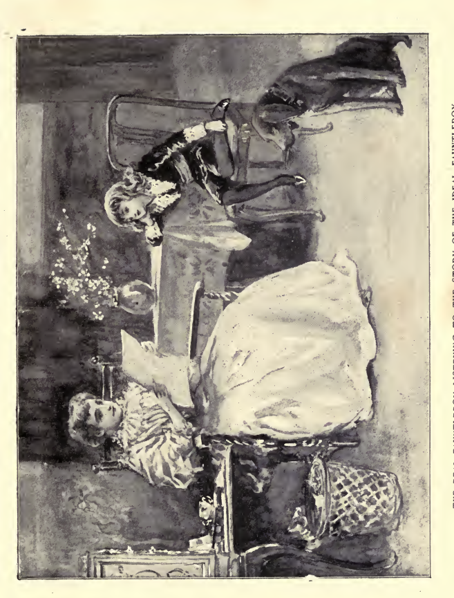
THE REAL FAUNTLEROY LISTENING TO THE STORY OF THE IDEAL FAUNTLEROY